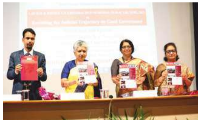
Hon'ble Justice B. V. Nagarathna, Supreme Court of India releasing LEXET in the midst of the Law Day Celebrations, 2022