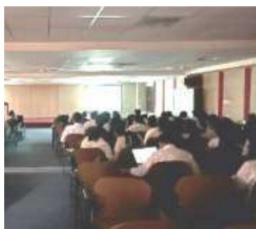
Film screening of "My Octopus Teacher" to commemorate Wildlife Week