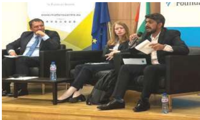
Participating in the panel discussion on "The Debate about the European Union Polity in Light of the War in Ukraine" during his tenure as a DAAD Scholar at BSEL, Germany