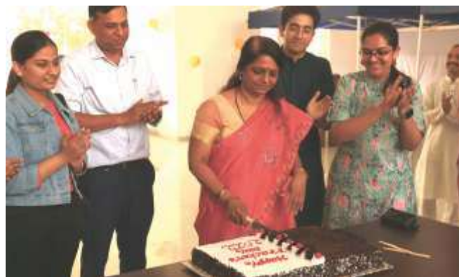
The Professors and students of SLS-P celebrating the Teachers' Day programme on 5th September 2022