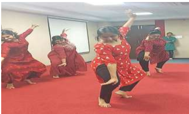
Members of the Extra Curricular Cell performing at Symphoria