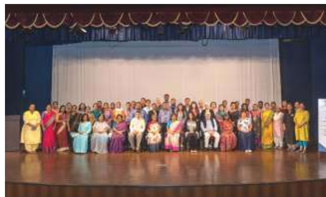
21st TS team at the Gifted Centre of Kaveri Group of Institutions