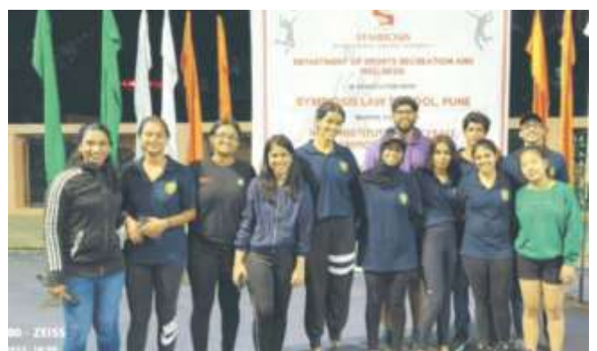
Members of the Sports Cell at the Inter Institute Volleyball Championship held by DSRW, SIU

The Sports Cell oversees and conducts the sports and related activities in the college. The Cell acts as a bridge between the University Sports Board of SIU and the college so as to promote the sports culture and facilitate the participation of the students in sports events and activities. To celebrate the month of Independence Day, the Sports Cell conducted the Pre Freedom for Fitness Run and further assisted Symbiosis Department of Sports, Recreation and Wellness (DSRW) in conducting Freedom for Fitness Run. The cell conducted various sporting events during Symphoria 2022. Over the semester, the cell has facilitated participation in various external fests like the Flames Champions League and the Basketball Tournament by MITACSC. The cell also conducted tryouts to form college teams for various sports. Lastly, the Sports Cell was instrumental in the organization of Symbhion 2022.