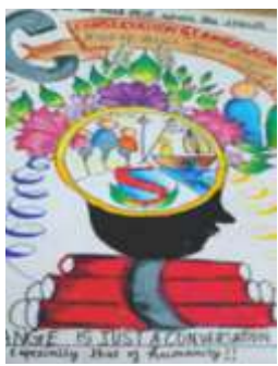
An entry from the poster making competition held during Symphoria 2022

The ECOCON Cell conducted a plethora of events to further the cause of environmental conservation. Members of the cell attended the 9th edition of compliance 10/10 held during compliance week. The Cell also organized a poster making and best-out-of-waste competition during SYMPHORIA 2022. In collaboration with the Animal Liberation Cell, the ECOCON cell held a documentary screening of 'My Octopus Teacher' to commemorate Wildlife Week. The Cell also held the Upcycling Sustainable Fashion Workshop in association with Corp Stage.