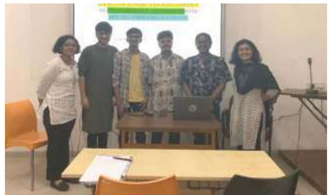
Members of the Law Econ cell at a group discussion on the topic "Impact of Russia - Ukraine conflict on Global Economic Recovery with special emphasis on Europe"

The Law Econ Cell aims to work in the interdisciplinary area of Law and Economics. The Cell hosted an event named "Crack the Fact" within the "Symphoria" event in August 2022 comprising 27 participants. The Law Econ Cell in collaboration with the Career and Professional Development Cell (CPD) and the Corporate Law Cell successfully organized a guest lecture series on Bankruptcy and Insolvency Law on 21st November 2022. The Cell also organized its first group discussion on 26th November 2022 on the "Impact of Russia - Ukraine conflict on Global Economic Recovery with special emphasis on Europe."