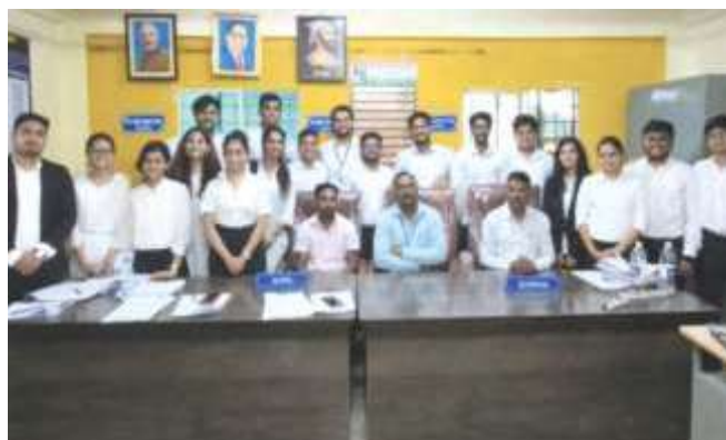
Members of the CLCL Cell at the Vinzar Gram Panchayat Office along with the Sarpanch and Up-Sarpanch