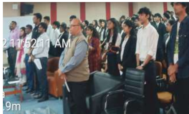
Pledge was taken by Faculty and Staff on the occasion of Constitution Day on 26th Nov 2022