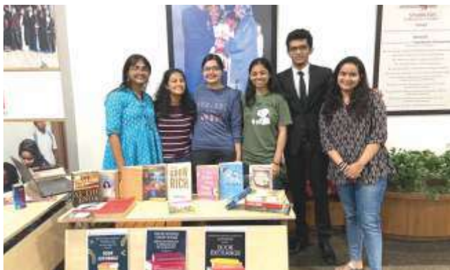
Members of the Rotaract Club organizing the Book Exchange Event from 13th-15th October 2022

The Rotaract Club is one of the biggest clubs at SLS, Pune and works for the betterment of the community. It entails the core values of caring and sharing and with this motto in mind, the club in collaboration with the Law Hawks Cell hosted a "Book Exchange Event" from 13th-15th October, 2022, wherein the students across the campus shared books with one another and overall, more than 50 books were exchanged in this process.