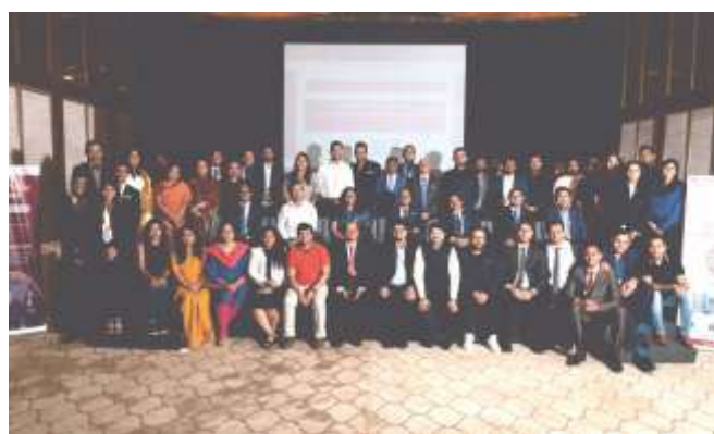
Destination Meet held in Mumbai - Recruiters & Alumni along with the Faculty and Members of Career and Professional Development Cell of Symbiosis Law School, Pune

The Career and Professional Development Cell has undertaken numerous activities for the holistic development of students. The Cell helps students to hone their abilities and bridge the gap between industry and academics. The CPD Cell hosted the Destination Meet of Symbiosis Law School, Pune in Mumbai wherein a panel discussion was held on the topic 'Legal Profession: Internationalization, Trajectory of Corporate Legal Sector and Litigation, Skill Set Required'. The Cell was also instrumental in assisting students secure placements at leading law firms, enterprises, think tanks, PSUs, government organizations and NGOs. The Cell also helped facilitate national and international internship opportunities to students. The CPD Cell actively assisted students from all batches in finding internships in top law firms, corporate, Government opportunities, PSUs, NGOs, think tanks, and other educational institutions. Under the aegis of the programme, as a part of its Training and Development activities, the CPD Cell organized various guest lectures and webinars.